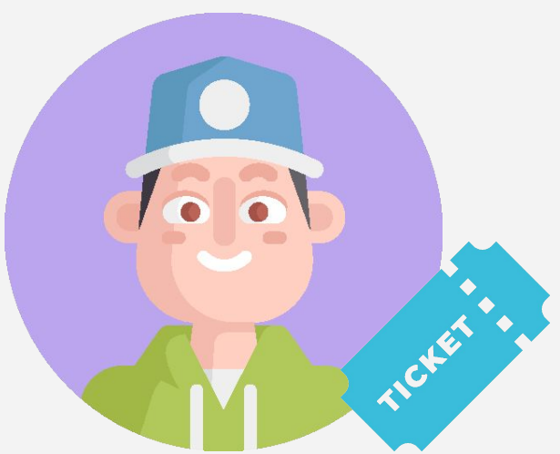
Event Ticket Validation