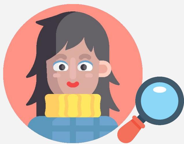
KYC / AML