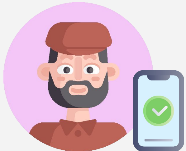
Verify with AuthID